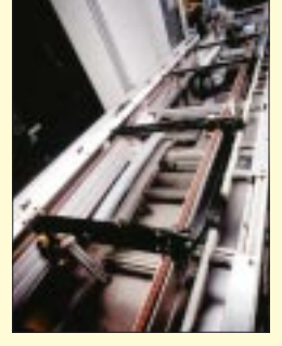
Automotive Glass Conveying